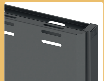
Vented rear and top sections allow for airflow to and from tiles.