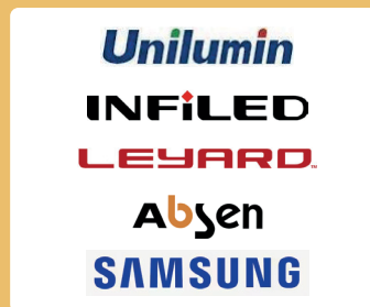
Dedicated to your choice of LED tile make and models.