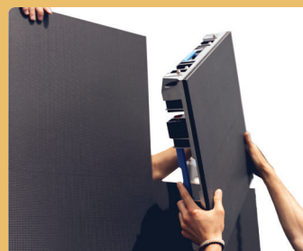
Easy assembly for quick and simple installation.